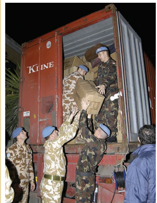
Peacekeepers from the United Nations Peacekeeping Force in Cyprus (UNFICYP) help volunteers in the Engomi district of Nicosia, Cyprus, to load a container with humanitarian relief supplies bound for tsunami victims in Sri Lanka. 19 January 2005.

CIMIC (meaning civil-military cooperation) is the military function integral to multidimensional operations, linking all cooperating parties and facilitating mutual civil-military support in order to reach the mission end state for the best of the local population, the civil actors, and the Alliance. It enables the military end state by coordinating and synchronizing military activities with civil actors, bringing