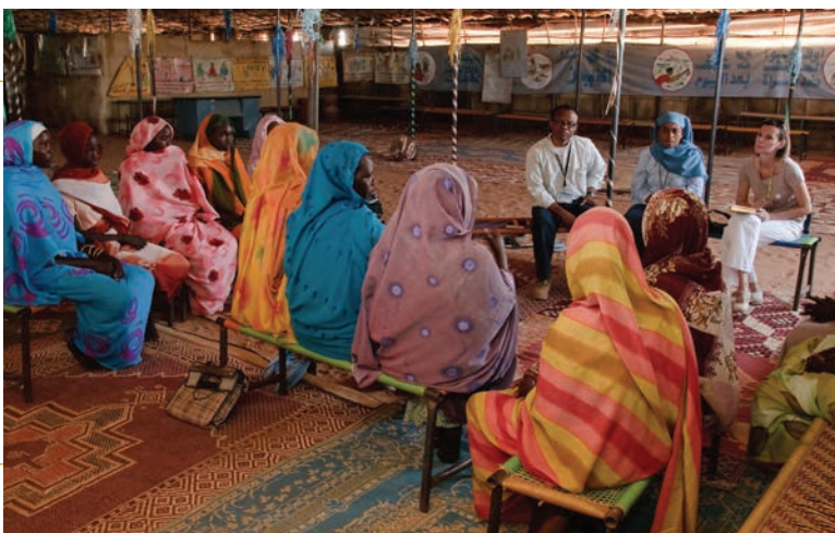
Three civil affairs officers of the joint African Union/United Nations Hybrid operation in Darfur (UNAMID) meet with a group of Internally Displaced Persons (IDPs) at a Women Community Centre in the Abu-Shouk Camp, to hear about their security and health situation in the camp. 3 February 2009. UN Photo #397932 by Olivier Chassot.

to a large degree, added to the confusion in terminology between what constitutes “peace operations” as opposed to “peace enforcement”, “stabilization”, or “conflict management”.