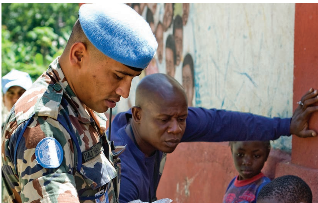
Members of the Nepalese contingent of the United Nations Stabilization Mission in Haiti (MINUSTAH) participate in CIMIC (Civil-Military Cooperation) activities in an orphanage located in Kenscoff. A peacekeeper gives children candies. 08 September 2009.

violence, containing the conflict, protecting civilians, and reviving the peace process, the HIPPO Report provides clear guidance on the use of force under more robust circumstances: