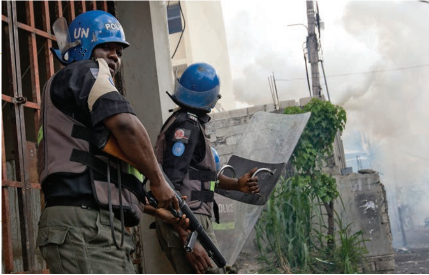
Two Members of the Formed Police Unit of the Nigerian contingent of the United Nations Stabilization Mission in Haiti (MINUSTAH) assist National Police officers to contain university student protesters. 12 June 2009.

including prominent religious, academic, and other civil society personalities, and regularly consult them on the peace operation's plans or get their feedback on ongoing or past campaigns. The point is to judge the effectiveness of the mission on the impact it is having on ordinary people — do they feel safer, or is their trust in the justice system decreasing?