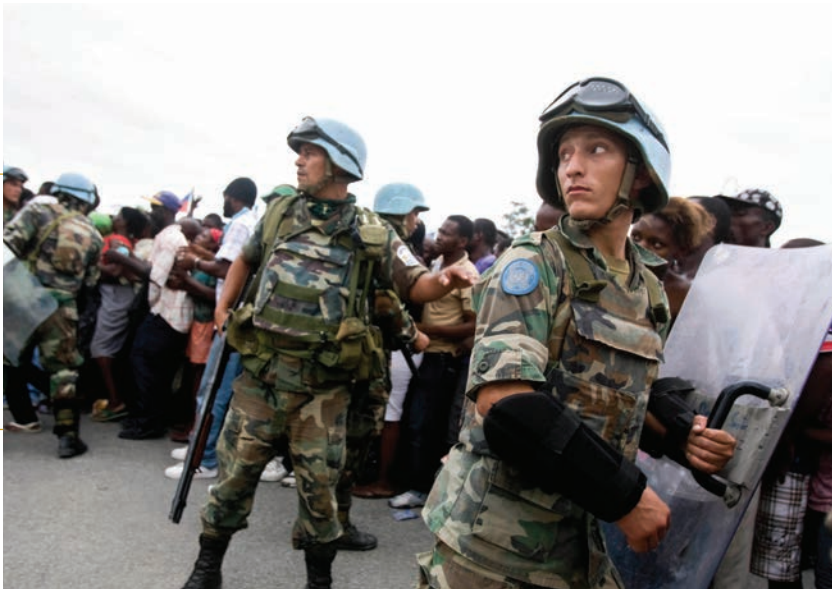
Uruguayan UN peacekeepers maintain order during a food distribution in downtown Port-au-Prince, Haiti. 25 January 2010.

The two core tasks of UN-CIMIC are civil-military liaison and information-sharing and civil assistance. Civil-military liaison and information-sharing relates to the first management function of UN-CIMIC (civil-military interaction). 5 Civil assistance relates to the second management function of UN-CIMIC (transition management), including mission and community support. 6 It is important to note that the work of UN-CIMIC officers will focus primarily on liaison and information sharing.