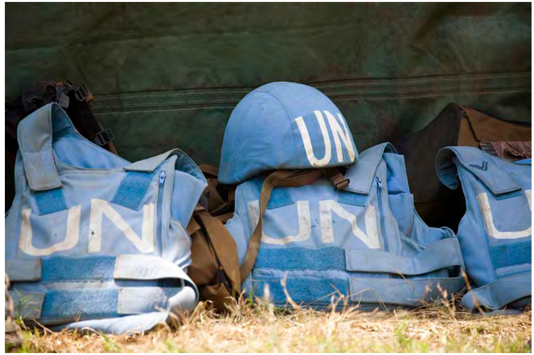
Helmet and flak jackets of the members of the 1 parachute battalion of the South African contingent of the United Nations Peacekeeping Mission in the Democratic Republic of the Congo (MONUC). 14 February 2008.

The Korean crisis and its aftermath highlighted the fact that the Charter provisions on the collective use of force, which were based solely on the agreement between the five superpowers on the Security Council, were not applicable. It highlighted the need for an alternative mechanism to restore peace in case of an outbreak of armed conflict. The United Nations peacekeeping operations were conceived and developed as this alternative mechanism. As further reading will show, PKOs were developed progressively and pragmatically, thanks to the vision and efforts of the successive Secretaries-General and other prominent internationalists, such as Ralph Bunche, Lester B. Pearson, and Brian Urquhart.