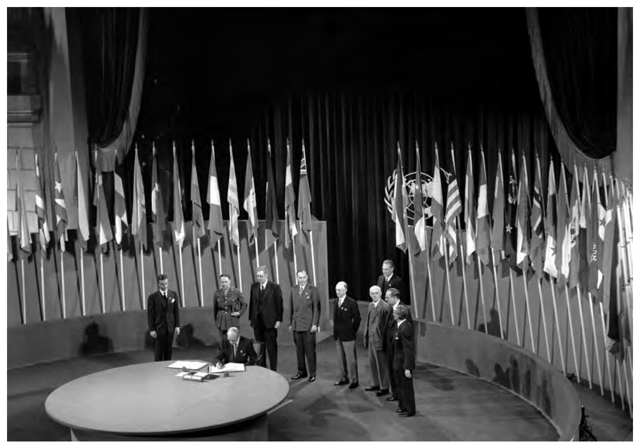
The Earl of Halifax, Ambassador to the United States; member of the Delegation from the United Kingdom, signing the United Nations Charter at a ceremony held at the Veterans' War Memorial Building. 26 June 1945.