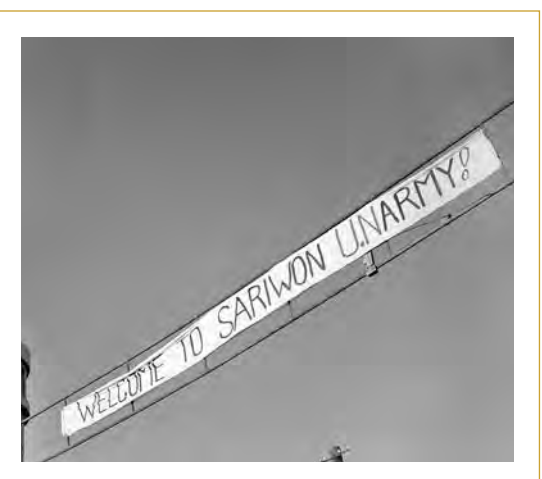
A sign in Sariwon, Republic of Korea. 1 October 1950.

At the time, the Soviet Union was boycotting the Security Council because of the question of the representation of China at the UN. In the absence of the Soviet Union, the United States draft resolutions were adopted and provided the basis to establish the United Nations Forces in Korea. When the Soviet Union realized the consequences of its