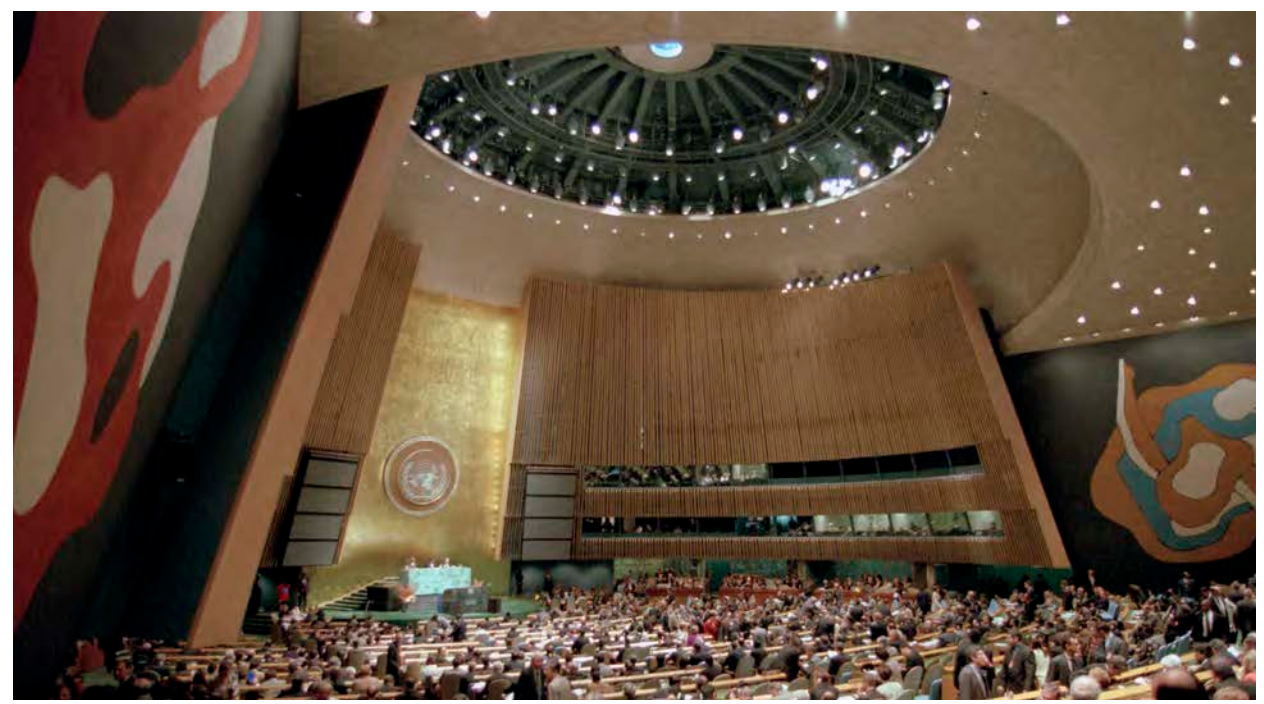
A general view of the fifty-fourth session of the General Assembly. 20 September 1999.

The repercussions of the Korean crisis led to a re-evaluation of the UN's role in peacekeeping. It was undoubtedly the Korean experience that prompted the United States to seek to enhance the role of the General Assembly to maintain international peace and security. At the 1950 session of the General Assembly, the US proposed a draft resolution to empower the Assembly to deal with matters in this field on an emergency basis. It proposed that if the Security Council failed to act because of the lack of unanimity among its Permanent Members, the General Assembly could then vote to act. Despite the strong objection of the Soviet Union, the Assembly adopted this proposal, known as the "Uniting for Peace Resolution," on 3 November 1950.